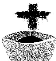
ENTER INTO THE SEASON OF LENT

Legión de María Reunión en Español St. Joseph Church