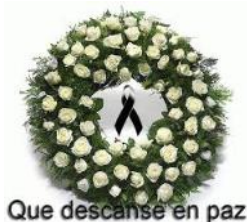
Que descansé en paz

Para confesarse fuera de los horarios sugeridos comunicarse con la oficina parroquial.