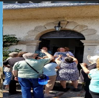
Yes! There will be many photo opportunities