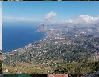
Beautiful Sicily Surrounded by the glory of the sea and its beauty!