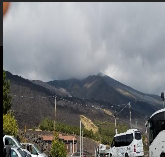
Mt. Etna has been active recently!