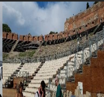
Teatro Greco Built in the Third Century