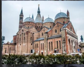
The Basilica of St. Anthony Padua